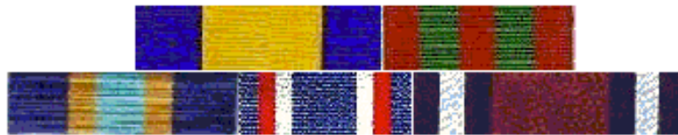
FIVE RIBBONS CINQ RUBANS