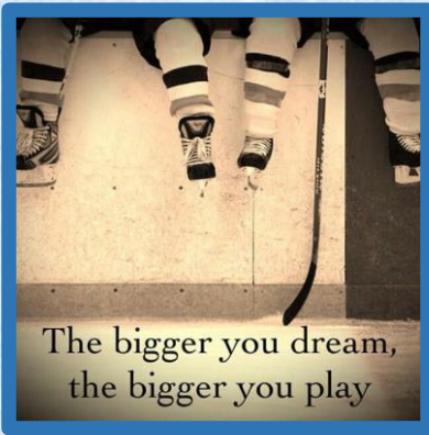
The bigger you dream, the bigger you play

February brings us the end of league play, provincials & the start of playoffs.