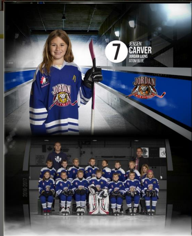
8x10 MEMORY MATE (EACH PLAYER WILL RECEIVES ONE)