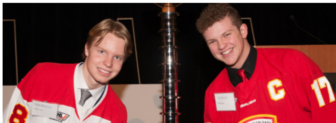
Calgary Flames captains, the 2015 - 16 tournament champions