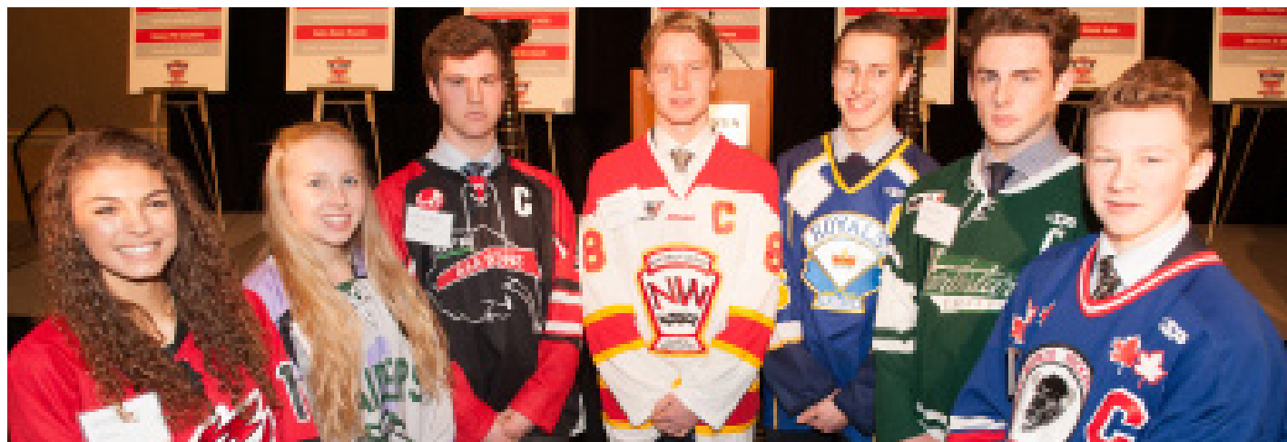
The captains from Calgary host teams: (Left to right) Calgary Fire, Rocky Mountain Raiders, CFR Chemicals Bisons, Calgary Flames, Calgary Royals, Calgary North Stars & Calgary Buffaloes

The Mac's tournament launches 39th year at annual press conference