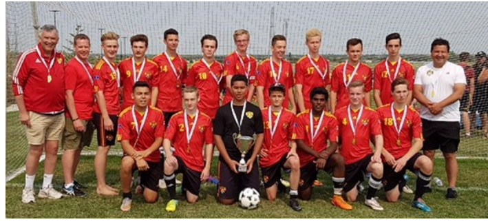
U18 T3 Phoenix Boys