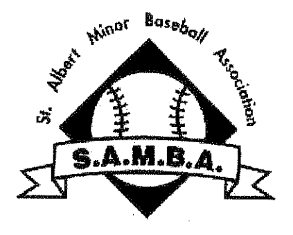
P.O. Box 218, St. Albert Alberta T8N 1N3