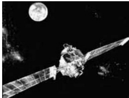
Figure A-6 Hermes Spacecraft

Hermes was the first high powered satellite in orbit which led to present day satellites used to broadcast television directly to individual homes using small low-tech satellite dish antennas.