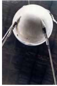
Figure A-1 Sputnik