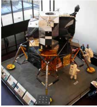
Figure A-5 Lunar Module (LM-2)