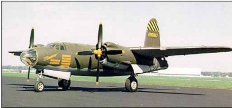
Figure A-2 B-26 Marauder Similar to "Times A Wastin"