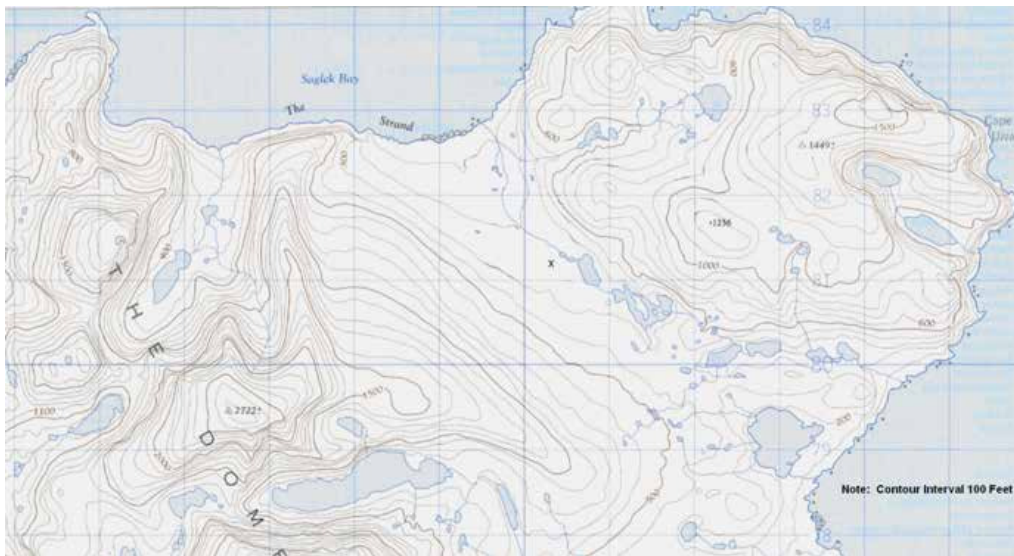
Figure A-5 Crash Site Marked With an "X"

Note. Created by Director Cadets 3, 2010, Ottawa, ON: Department of Defence.