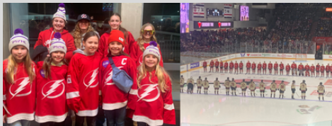
PWHL OTTAWA HOME OPENER January 2, 2024

Several of our players were lucky enough to take in the action on opening night and a great time was had by all!!!