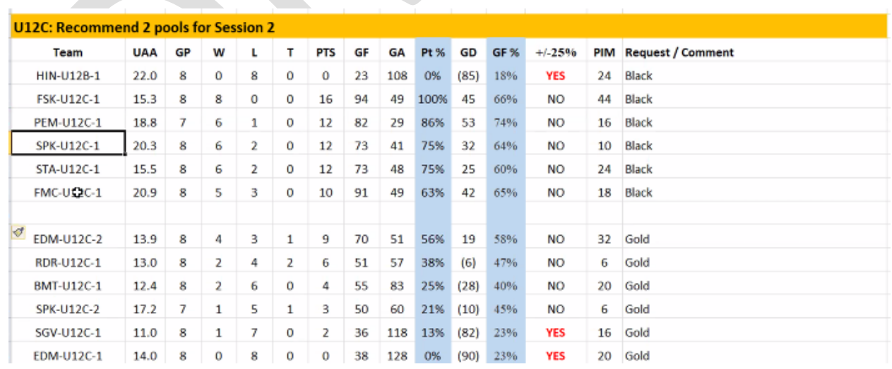
U12C - No movement.

If there are any problems after the meeting, please let us know as soon as possible.