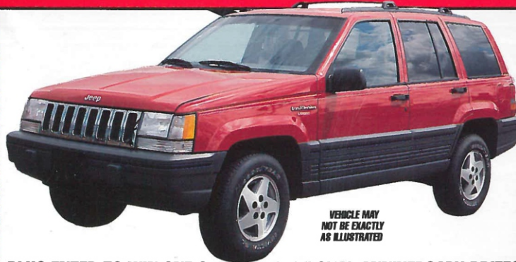
VEHICLE MAY NOT BE EXACTLY AS ILLUSTRATED

PLUS YOU COULD WIN THIS 1993 JEEP GRAND CHEROKEE!