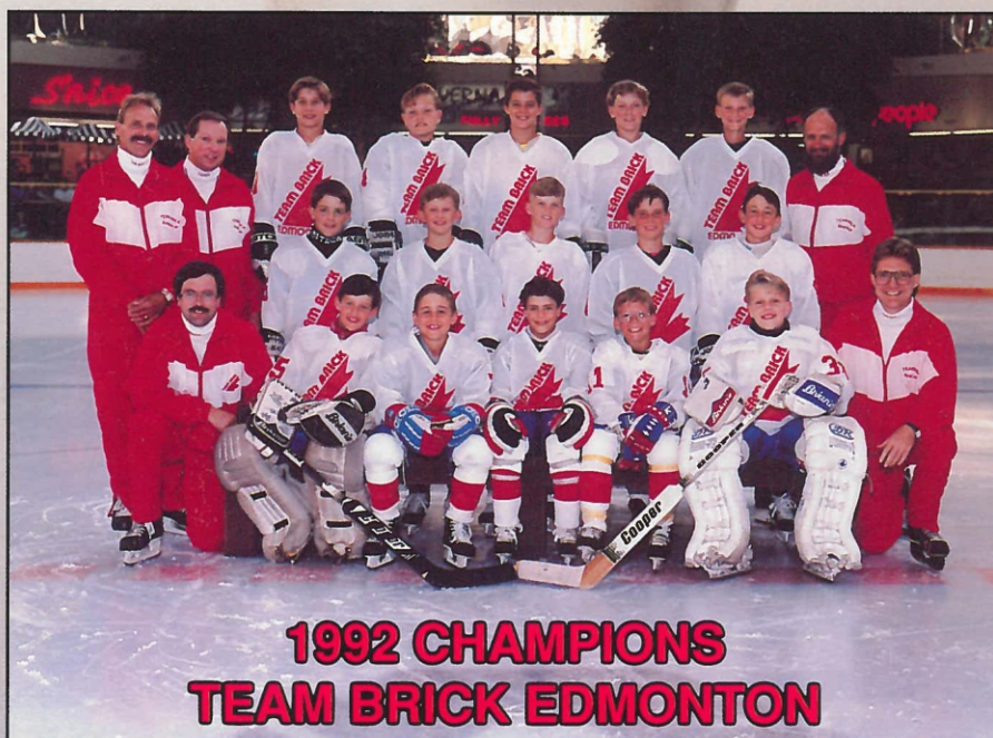
1992 CHAMPIONS TEAM BRICK EDMONTON