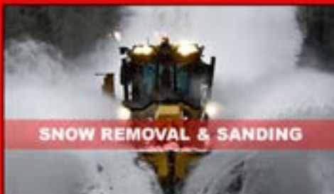
SNOW REMOVAL & SANDING