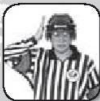
Checking to the Head