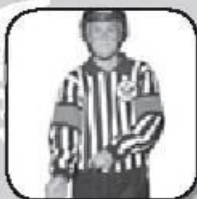
Holding the Stick