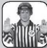
Checking from Behind