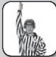
Icing the Puck