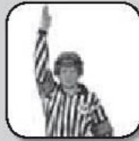
Delayed Calling Penalty