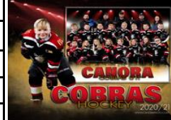
Sportmate (design may vary)