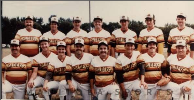
1983 CARMAN SENIOR GOLDEYES