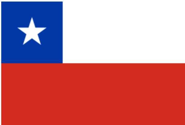
CHILE - OPEN