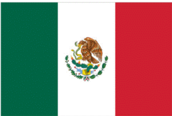
MEXICO – OPEN