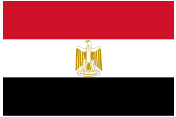
EGYPT – OPEN