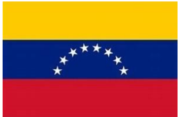
VENEZUELA – OPEN