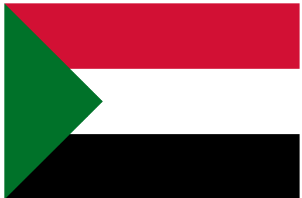
SUDAN – OPEN