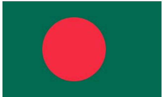
BANGLADESH – OPEN