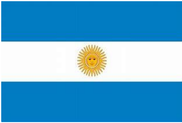
ARGENTINA - OPEN