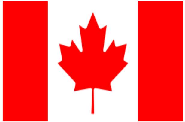
CANADA - OPEN