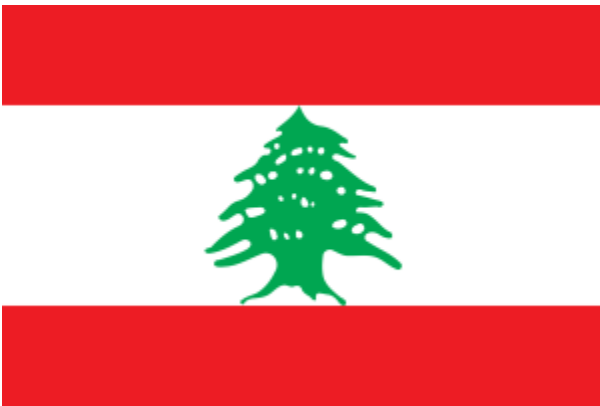
LEBANON - OPEN