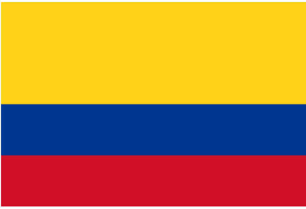
COLOMBIA – OPEN