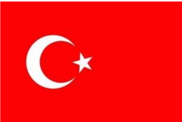
TURKEY - OPEN