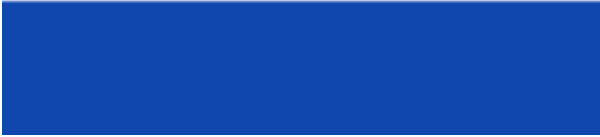
EL SALVADOR – OPEN