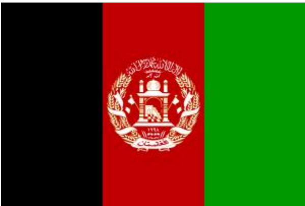
AFGHANISTAN – OPEN