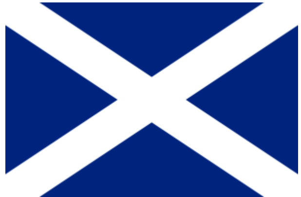
SCOTLAND – OPEN