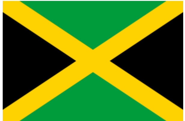
JAMAICA – OPEN