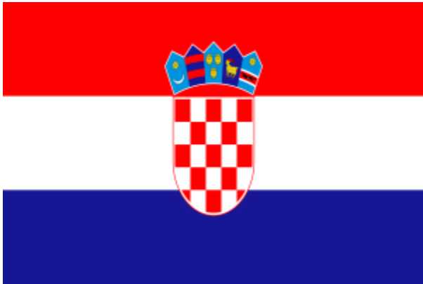
CROATIA - OPEN