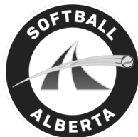
ZONE EIGHT Vacant info@softballalberta.ca