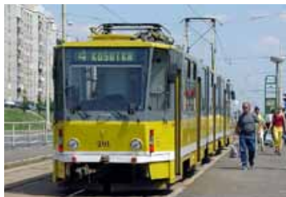
Tram system in Plzen (#4 goes from hotel area to arena)