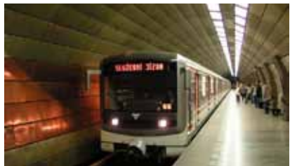
Subway system in Prague