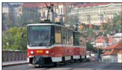
Tram system in Prague

Pictured (above) is the team bus we have for our travel. Below is tram and subway system in Prague and tram in Plzen.