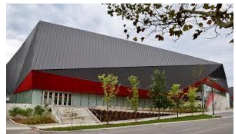
Exterior Photo above of the Athletic Centre

Please make sure that those who are participating in the opening ceremonies (coaches and athletes) bring an indoor pair of shoes for the gymnasium floor. Winter boots are not permitted on the gymnasium floor. We will have volunteers on hand to help direct the participants inside and out.