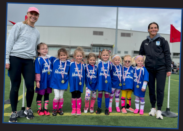
U5G Rosewood Rockets! So cute!