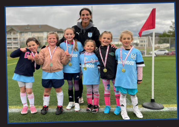
U7G Lakewood Phoenix sporting their medals!!

U7B Timbers had a blast! Siblings got in on the action too!!