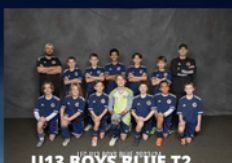
U13 BOYS BLUE T2