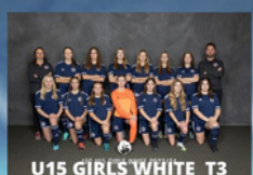
U15 GIRLS WHITE T3