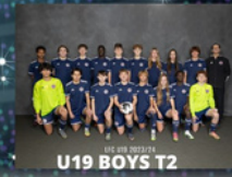
U19 BOYS T2