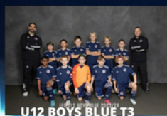
U12 BOYS BLUE T3