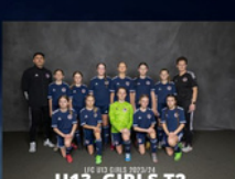
U13 GIRLS T2