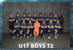
U17 BOYS T2