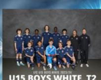
U15 BOYS WHITE T2