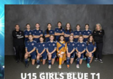
U15 GIRLS BLUE T1