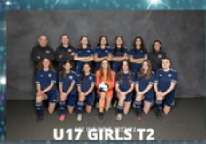
U17 GIRLS T2