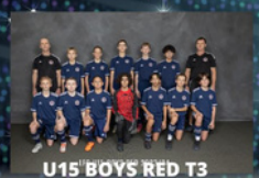
U15 BOYS RED T3