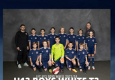
U13 BOYS WHITE T3