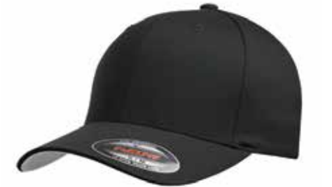
Available Sizes: XS, S/M, L/XL, XL/XXL