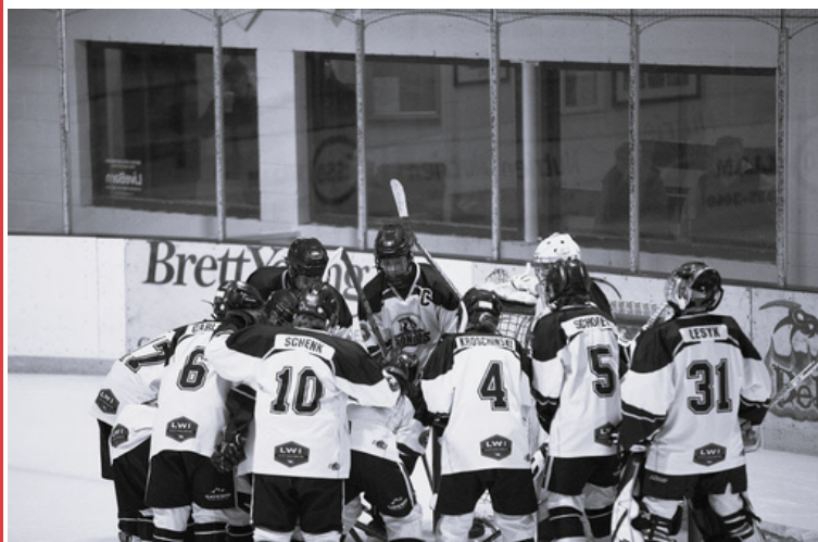
U15-2 Blindman Valley Broncos