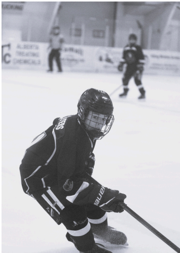
“Tanya blessed us all year with photos of our kids. We appreciate you!”