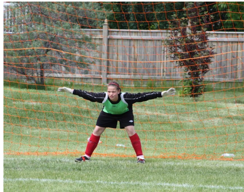
Outdoor Youth Provincials 2013 June 28 – July 1 Moose Jaw, SK