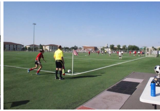
PSL Finals, August 25, 2013, Saskatoon, SK