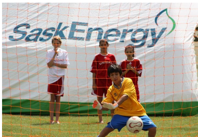
SaskEnergy Provincial Skills Competition Indoor - March 2, 2013 and Outdoor - June 29, 2013

Thank you to SaskEnergy for their generous sponsorship of the SaskEnergy Skills Competition at the Indoor/Outdoor Youth Provincials!