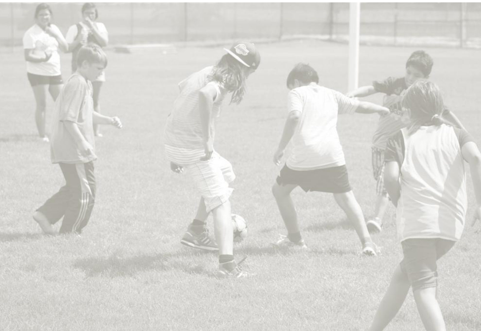
North American Indigenous Games Powerspot Event, July 26, 2013, Regina, SK