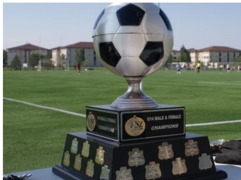
PSL Finals August 25, 2013 Saskatoon, SK