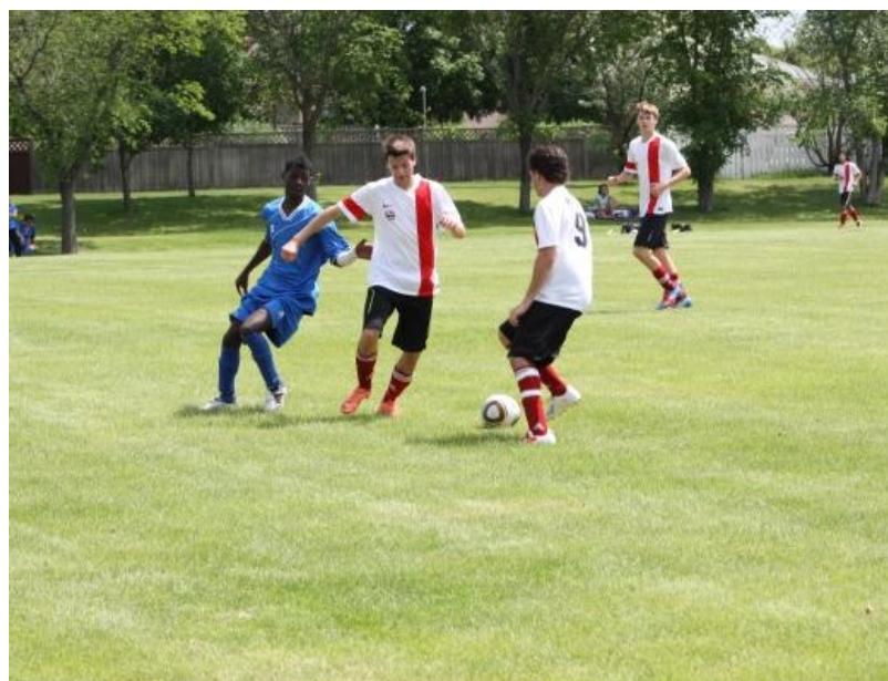
Outdoor Youth Provincials, June 28 – July 1, 2013, Moose Jaw, SK