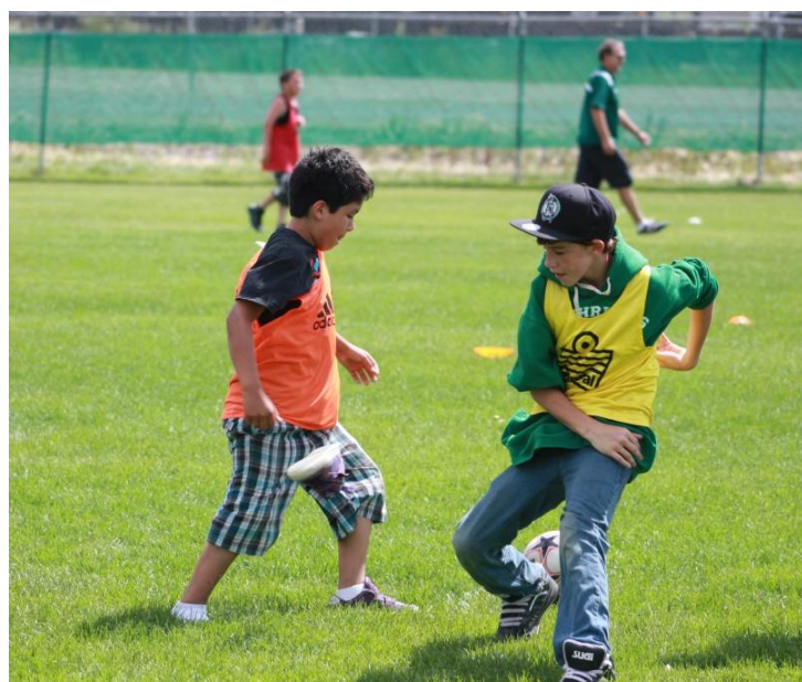
NAIG Powerspot Event, July 26, 2013, Regina, SK