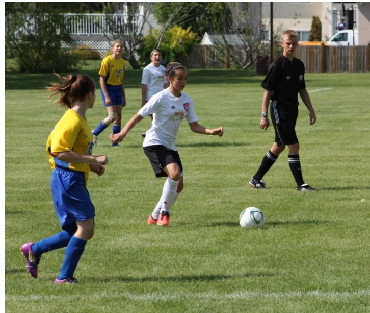
Outdoor Youth Provincials, June 28-July 1, 2013, Moose Jaw, SK