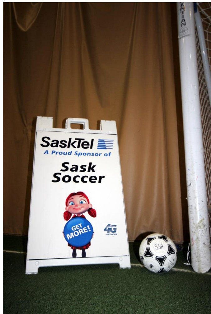
SaskTel Indoor Provincial Championships, 2013, Regina, SK

We sincerely appreciate SaskTel and DirectWest's longtime sponsorship of the Saskatchewan Soccer Association. SaskTel's continued support of SSA's Grassroots programs, events and initiatives are appreciated by the SSA and our members and participants who benefit from their sponsorship and patronage.