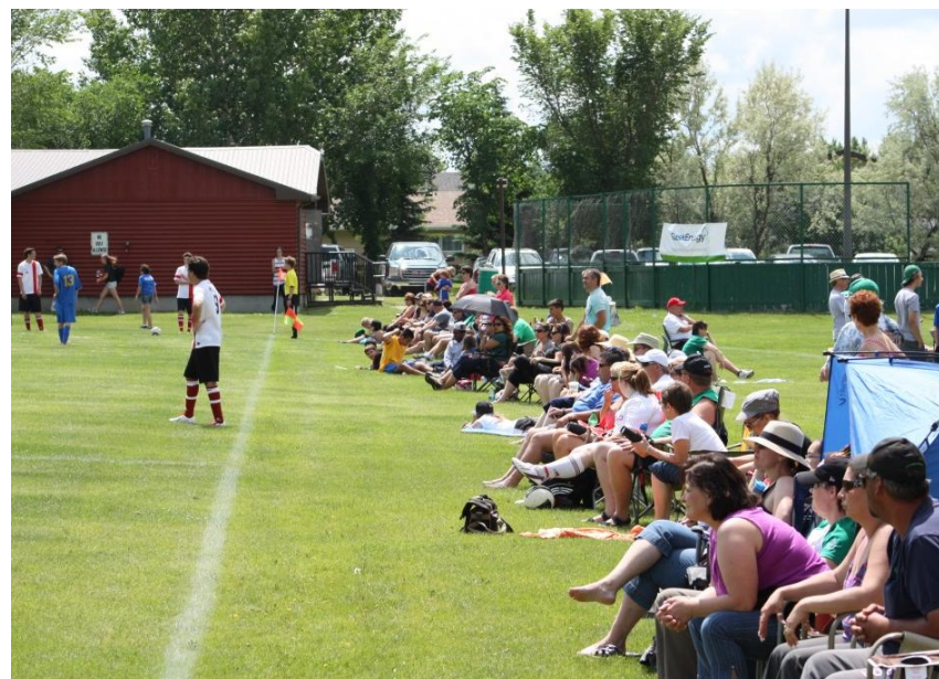
Outdoor Youth Provincials, June 28 – July 1, 2013, Moose Jaw, SK