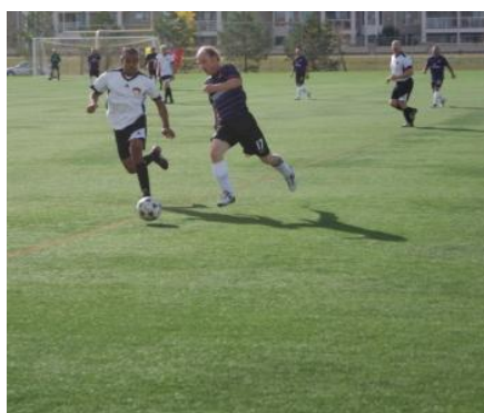
Western Masters Championships September 26- 28, 2013, Saskatoon, SK

Saskatchewan Soccer Association has a vision “to be a dynamic and innovative organization, which enriches the lives of our participants through the development of strong relationships and delivery of soccer programs and services which are of the highest quality.” With the dedication of our Board members and the tireless work of our staff, I am proud to say that we are continuing to drive towards that vision. The individuals that are involved in soccer throughout the province have offered the utmost support for the Board of Directors and all of our staff. I am proud to have served as the President of the Saskatchewan Soccer Association this past year.