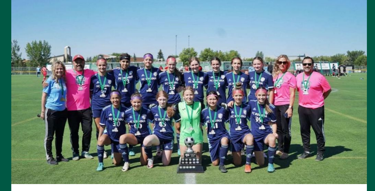
Under 15 Girls Gold: FCR Bluestars