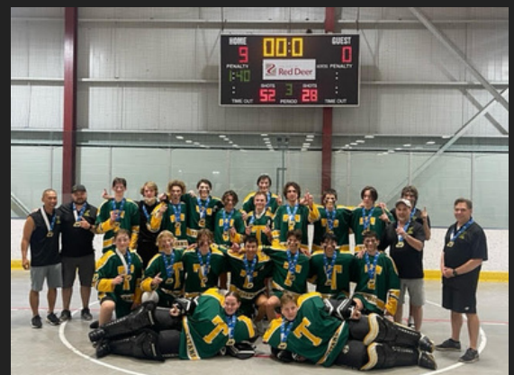
Titans 16UA WRLL Provincial Champions

Not only did the Titans 16UA team become the North Division Champions of the WRLL, but they then went on to become the WRLL Provincial Champions! Congratulations to all of the players, coaches and parents!