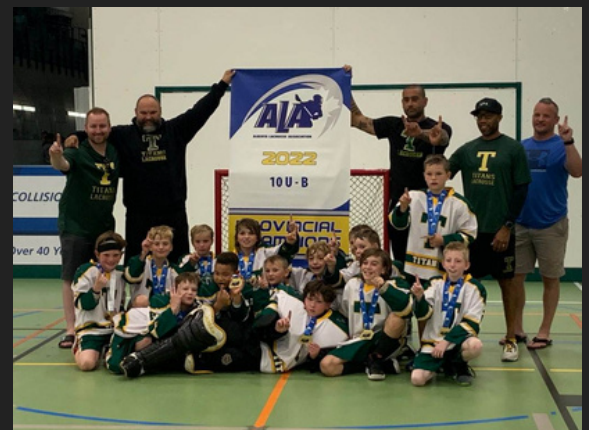
Titans 10U-3 Alberta Minor Box Lacrosse Provincial Champions