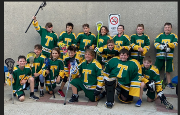
Titans 12U B-1

Congratulations to the Titans 10U-3 team that went undefeated and won the gold medal to become the 10U Alberta Minor Box Lacrosse Provincial Champions!