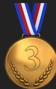
Titans U15A Bronze Medal Curtis Ptolemy Tournament