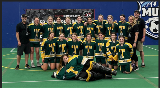
Titans U17-W Bate Silver Medal Girls Rock Tournament