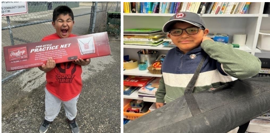
Combining softball and studies never hurts. Ball + Books = A great Student.

Rule #1 in Softball Club - Spread the word and talk about starting a Softball Club in your school!