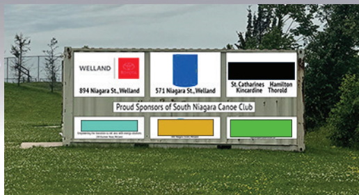
Example of container #8 with spaces sold to generate funds.