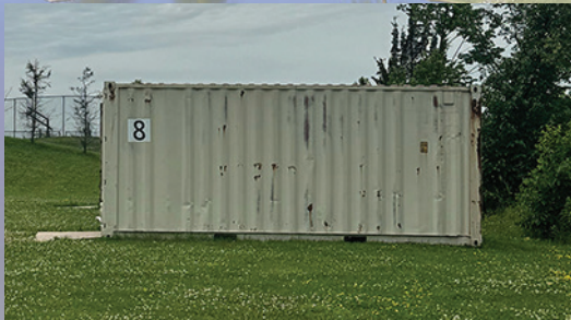
Container #8 as it is now.

employers mechanic hairstylists service clubs employers family members