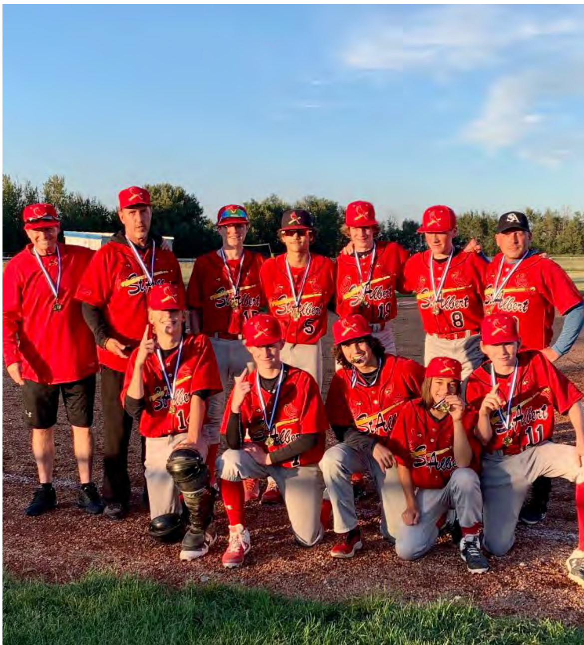
15U A Team – City Champs!