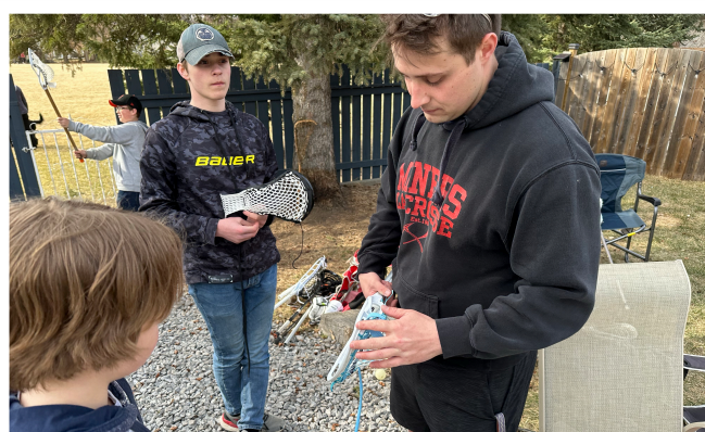
Photo Day Fun