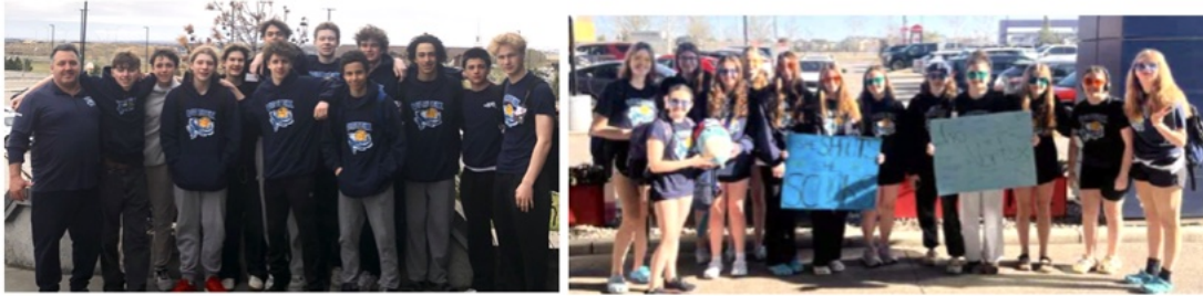
Vortex 16U Teams