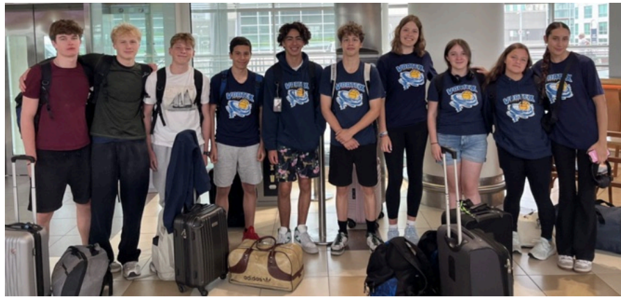
Ottawa Exchange Trip