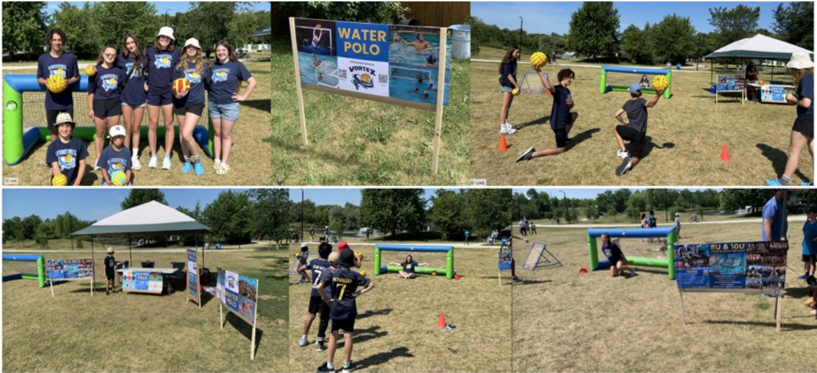
Sport Manitoba hosted a Game Day session at Assiniboine Park on July 5, 2025