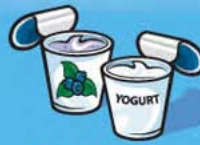
Yogurt 175 g (¾ cup)