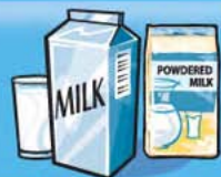
Milk or powdered milk (reconstituted) 250 mL (1 cup)