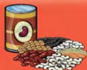
Cooked legumes 175 mL (¾ cup)