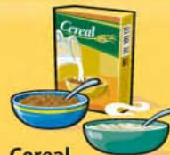
Cereal Cold: 30 g Hot: 175 mL (¾ cup)