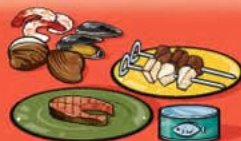
Cooked fish, shellfish, poultry, lean meat 75 g (2 ½ oz.)/125 mL (½ cup)