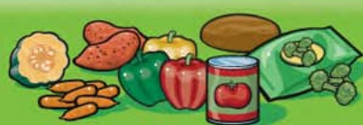
Fresh, frozen or canned vegetables 125 mL (½ cup)