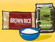
Cooked rice, bulgur or quinoa 125 mL (½ cup)