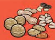
Shelled nuts and seeds 60 mL (¼ cup)