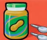
Peanut or nut butters 30 mL (2 Tbsp)