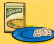
Cooked pasta or couscous 125 mL (½ cup)