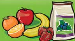
Fresh, frozen or canned fruits 1 fruit or 125 mL (½ cup)