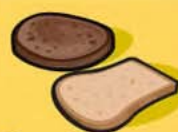
Bread 1 slice (35 g)