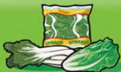
Leafy vegetables Cooked: 125 mL (½ cup) Raw: 250 mL (1 cup)