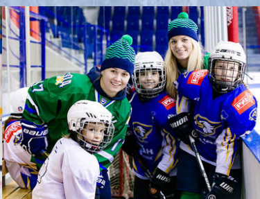
RUSSIA: VARIOUS CITIES