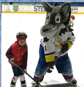
SLOVAKIA: SPISSKA NOVA VES