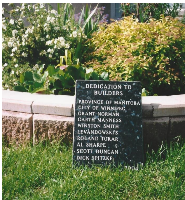
The Builders Stone was unveiled in August, 2004