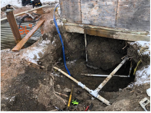
Left: new lines at water tanks Above: February water repairs Right: New field drain