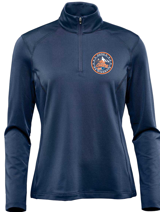
Colour Option: Navy